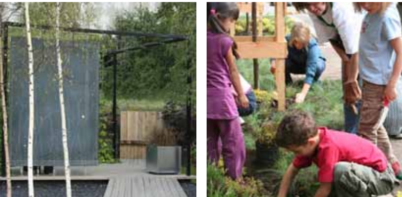
Hortus urbanus et École Arc-en-Ciel