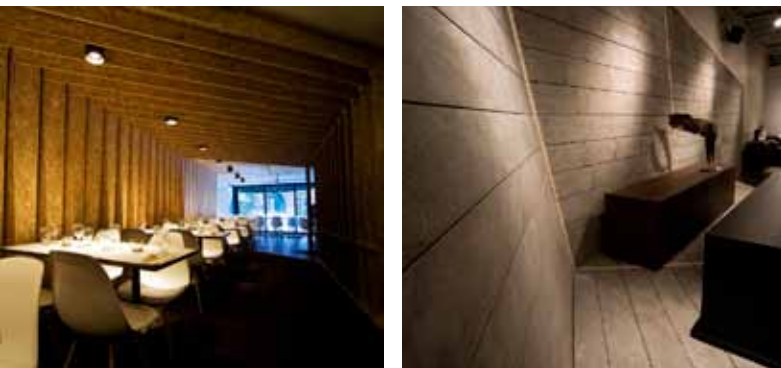
Restaurant Tamarin et boutique Domison