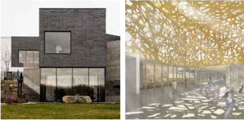
Strom spa et Bibliothèque Saint-Laurent