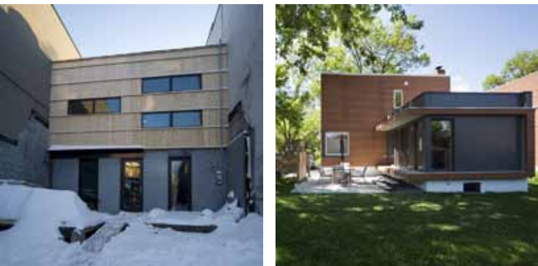
La brèche et De Lille au cube