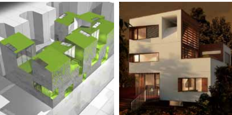
Nature Urbaine et Résidence LEED Platine