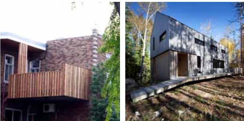
Balcon accroché et Résidence Rochemaure