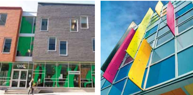
Cactus et Le Chat des artistes