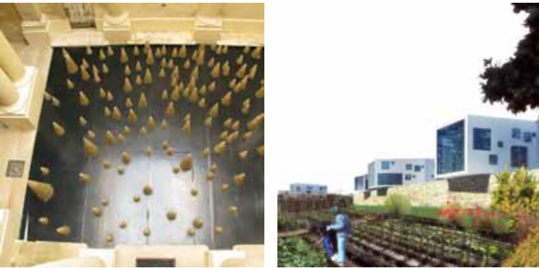
ArchitVives, Europan-10