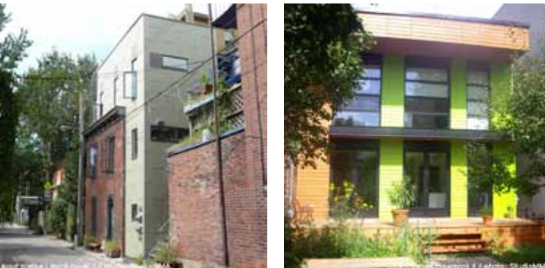
Ajout Plateau Mont-Royal et Rénovation Rosemont