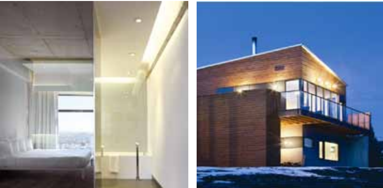
Hôtel PUR et Résidence Dumas