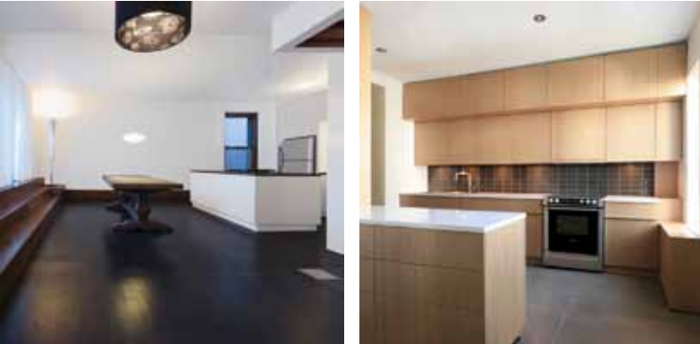
Villa St-Joseph et Résidence NDG