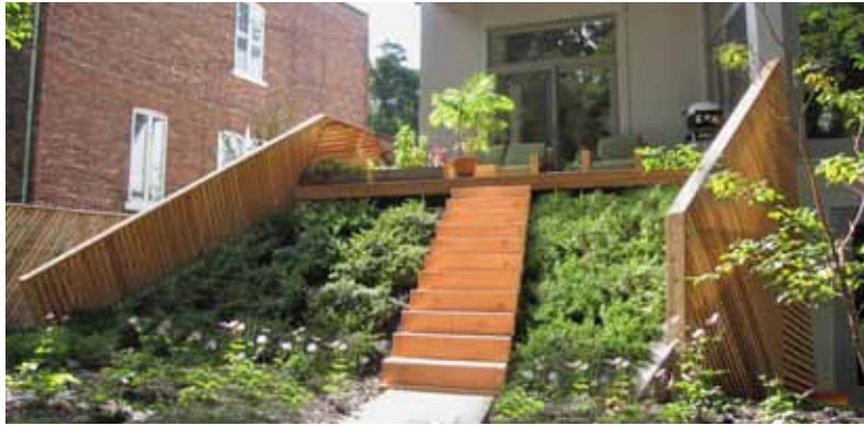
Russell galerie