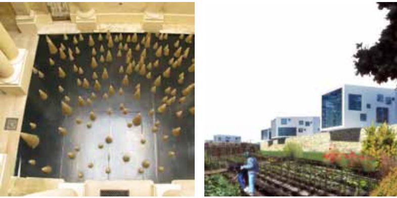
ArchitVives, Europan-10