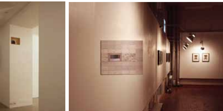
Thin Spaces