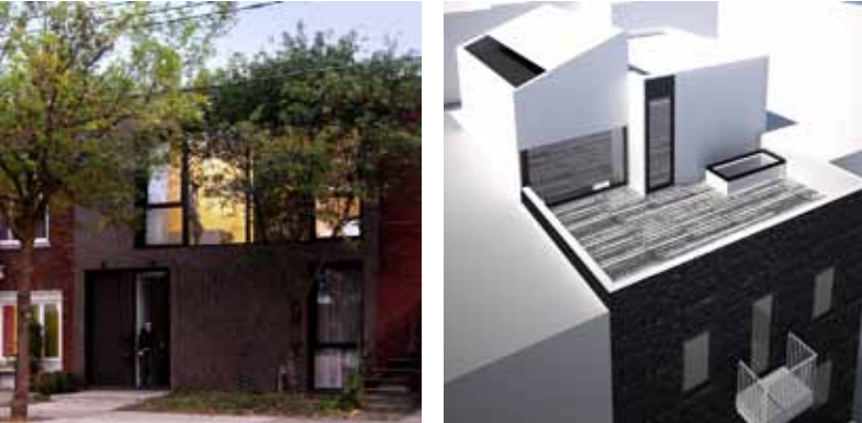
2x1000, rue Alma © TBA

TBA follows a multi-disciplinary approach that is anchored by architecture, design, art, and research. Founded in Montréal by Tom Balaban, in 2009, this three-person firm primarily works in the sectors of residential and commercial architecture.