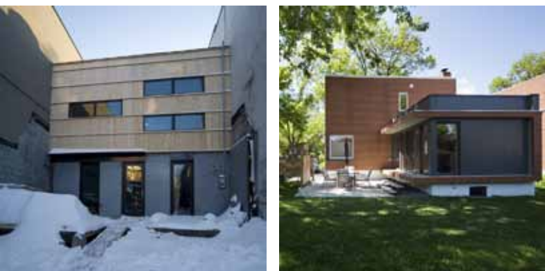
La brèche et De Lille au cube