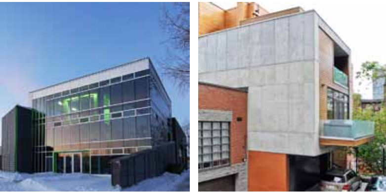
Côté Jardin et Résidence Stanley