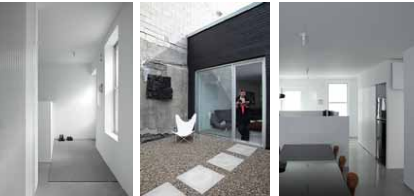
Maison Garnier