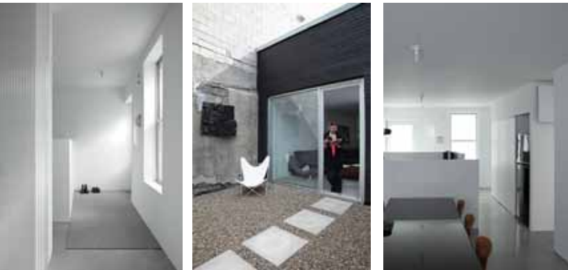
Maison Garnier