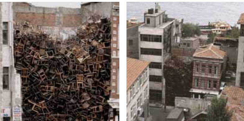
Istanbul