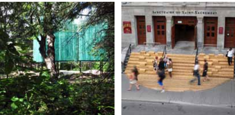
Jardins de Métis et Paysages Éphémères © Suresh Perera

Studio Perera was founded in 2008, in Montréal, by Suresh Perera. In attempt to re-discover a broader definition of the practice of architecture, he tries to blur the dichotomies between the object-artifact and the building, between function and desire, between the written word and image, and between city and garden.