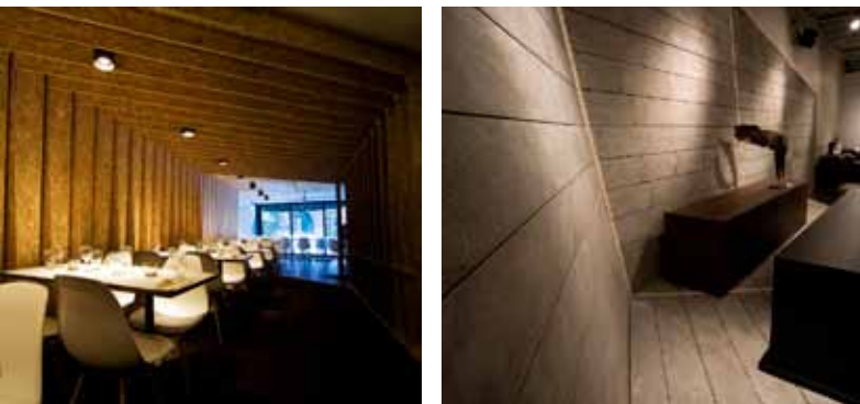
Restaurant Tamarin et boutique Domison