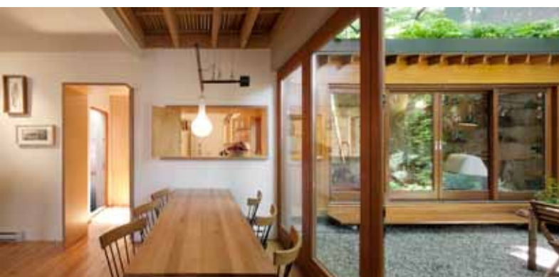
maison Bernier Thibault