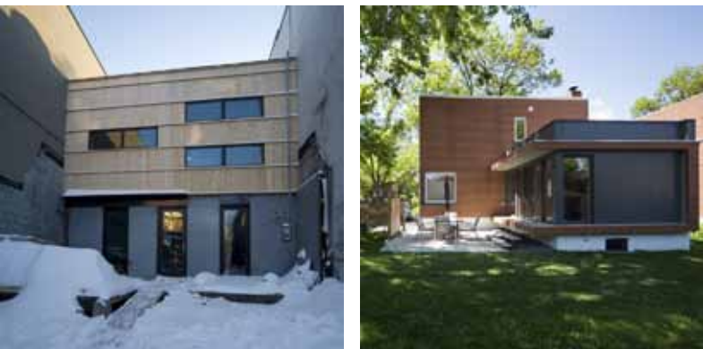
La brèche et De Lille au cube