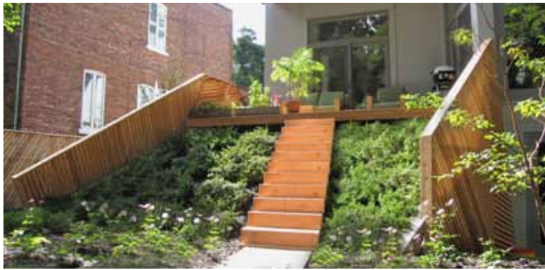
Russell galerie