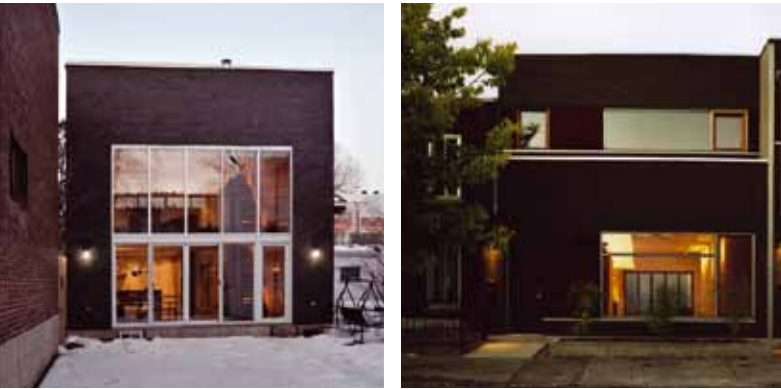
4417 Christophe Colomb et 6747 St-Urbain

The approach of Henri Cleinge manifests as a reflection on modernism while avoiding absolute abstraction. A conceptual approach is organized and translates through an expression that is stripped of space and light, and incorporates natural materials in their raw state (wood, steel, concrete).