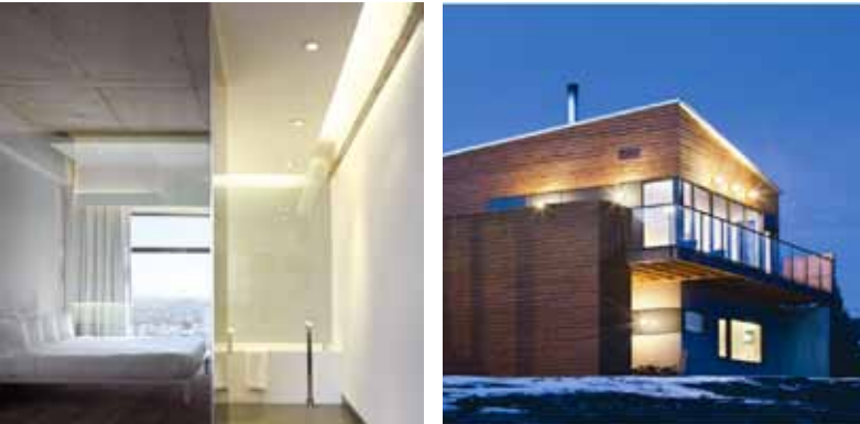
Hôtel PUR et Résidence Dumas