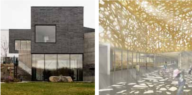
Strom spa et Bibliothèque Saint-Laurent