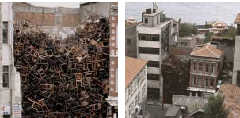
Istanbul